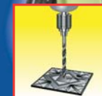
CERAMIC TILE AND MARBLE