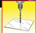
GLASS, CRYSTAL, AND MIRROR