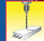
MASONRY, CONCRETE AND GRANITE