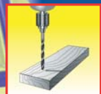
WOODS AND PLASTICS