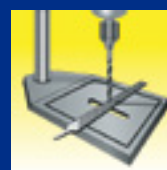
Hardened Steel & Cast Metal