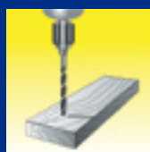
Woods & Plastics