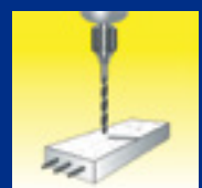
Masonry, Concrete & Granite